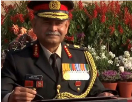
Science and tech/Space/Defence